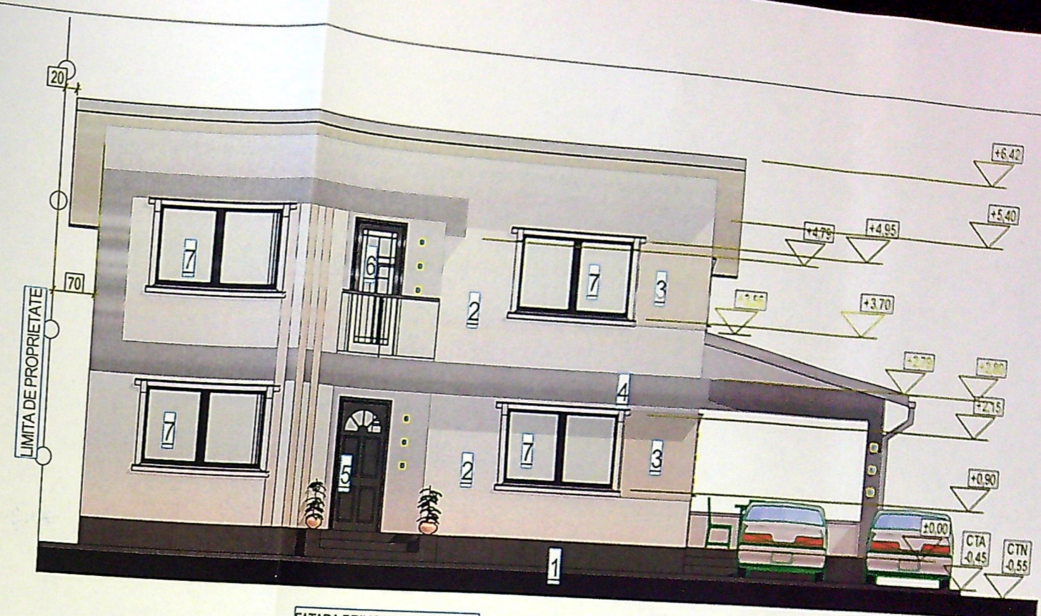
FATADA PRINCIPALA/DE VEST

Finisaje: 1- soclu impermeabil gri inchis; 2-tencuiala decorativa alba; 3-rilaj orizontal imitatie lemn; 4-tencuiala decorativa gri inchis; 5-usa metalica antracit cu geam termopan securizat; 6-usa PVC antracit cu geam securizat; 7-fereastră PVC antracit cu geam termopan